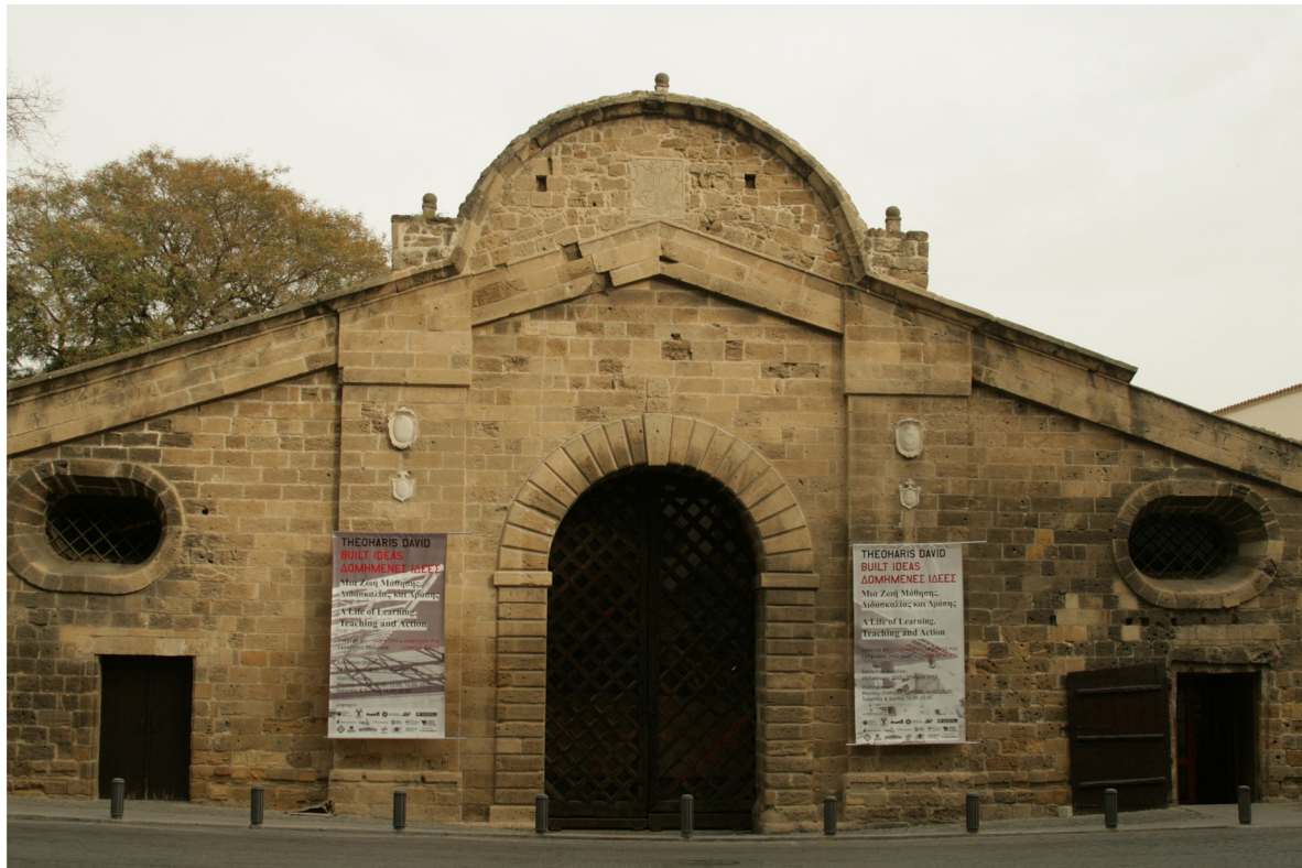
BUILT IDEAS EXHIBITION AT FAMAGUSTA GATE, NICOSIA 2013